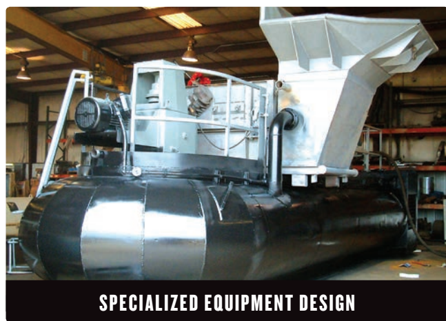
SPECIALIZED EQUIPMENT DESIGN