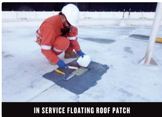
IN SERVICE FLOATING ROOF PATCH