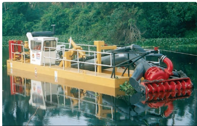
HIGH VOLUME DREDGING