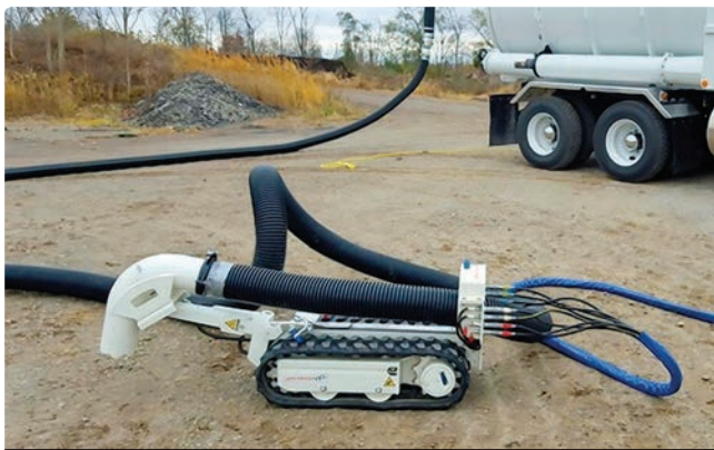
AUTOMATED CLEANING SYSTEMS