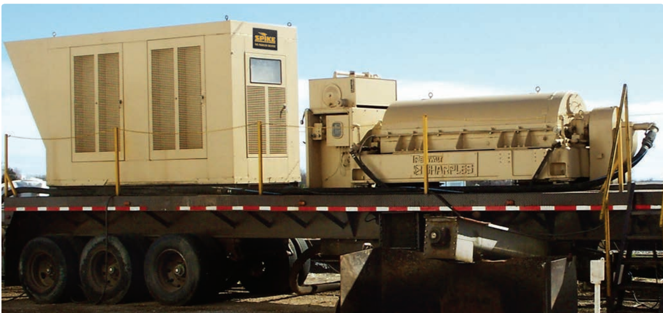
SOLID SEPARATION SERVICES